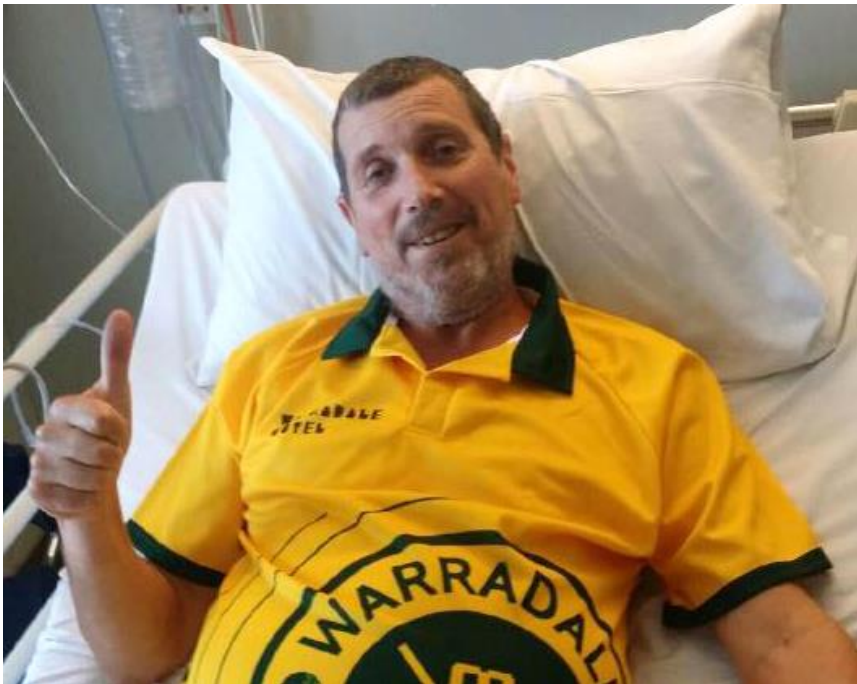
Nooge in Flinders Medical Centre in early February 2017