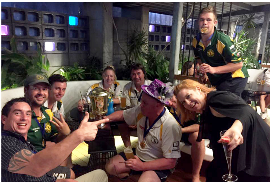
At the Warradale Hotel, after winning the B grade premiership.