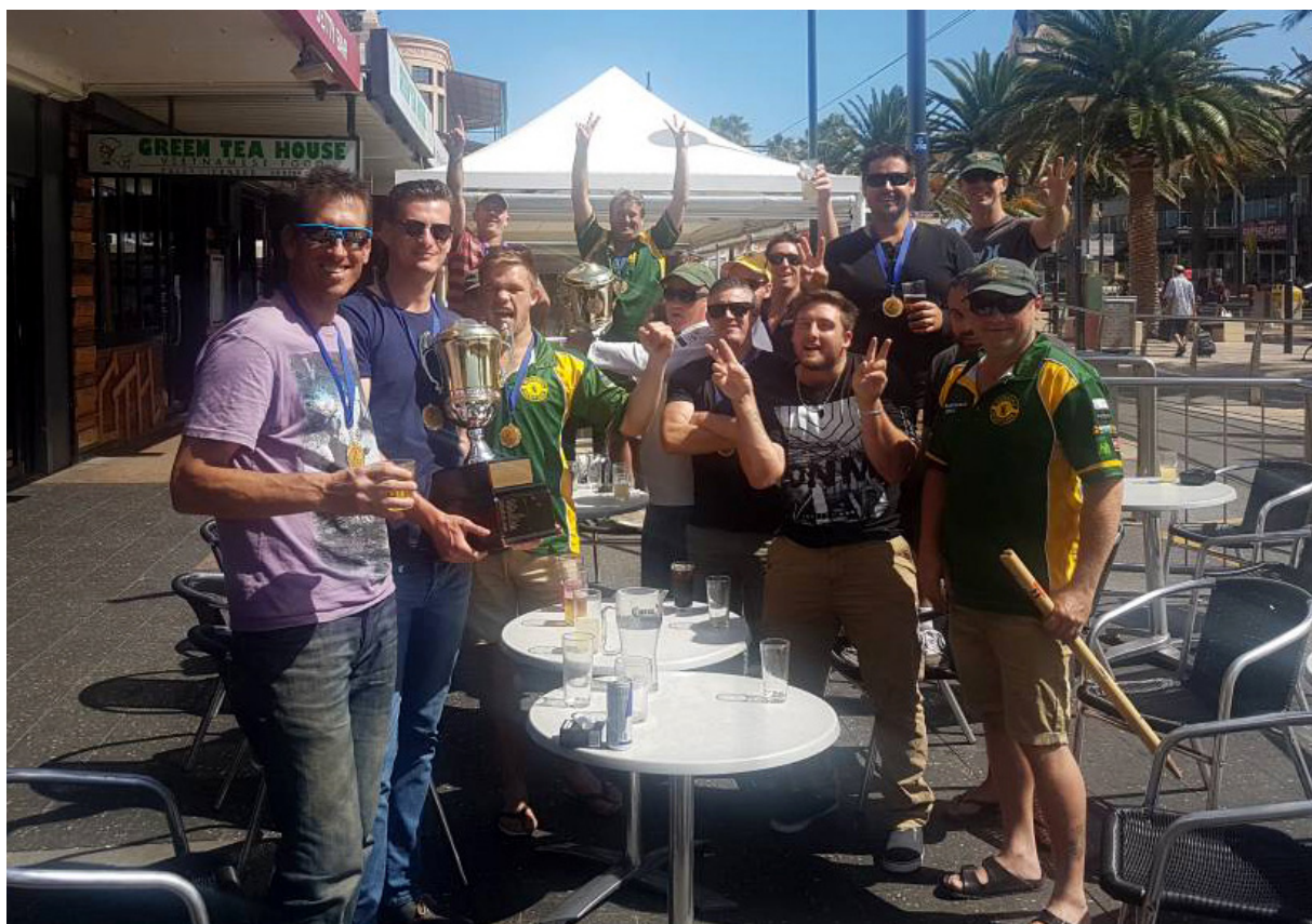
^ Jetty Bar on Monday 27-Mar