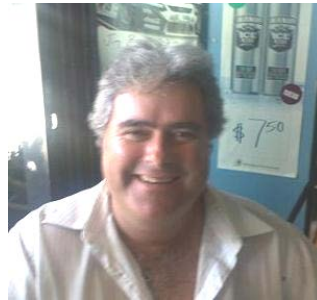
Win... Before and